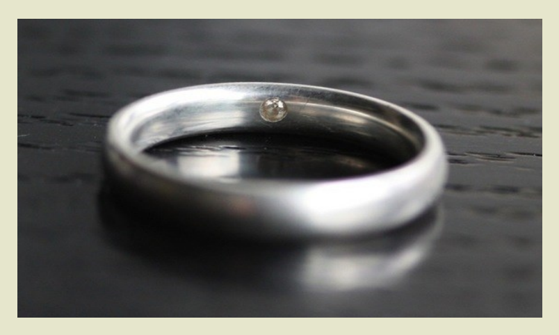
opening with a flawless, 0.02 carat diamond.

So how does it work? First, the purchaser needs to collect saliva samples (with a cotton swab on the inside of his or her cheek). This is then sent to Grass' lab in Switzerland, where the sample is processed and DNA is extracted and purified. The scientists add chemicals to the liquid solution containing the DNA to promote the growth of glass that "fossilizes" and encapsulates the DNA at room temperature. "The result is powdered glass containing tiny strands of DNA", Grss said. Once they have this substance, the scientists then drill a small hole on the inside of a piece of jewellery (a ring, for instance), fill it with the powder and seal the