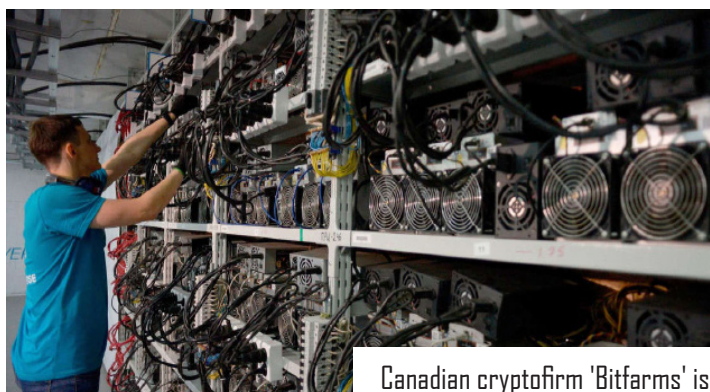
Canadian cryptofirm 'Bitfarms' is planning a huge new bitcoin mining

once it gets filled up with enough transactions. The hash is then verified by a miner node.