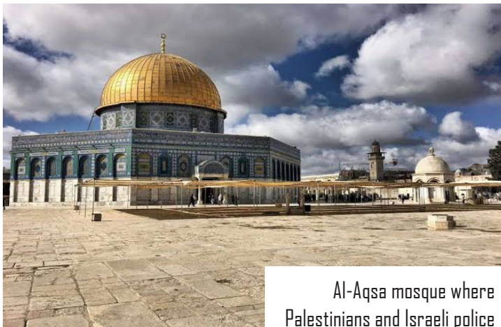
Al-Aqsa mosque where Palestinians and Israeli police clashed

India has followed a policy of mutual coexistence and supports the two-state solution to the conflict. It was until 2017 that India openly supported the Palestinian cause but later in 2017 PM Modi changed its stance supporting the peaceful coexistence of Palestine with Israel. India maintains cordial relations with both nations. India established diplomatic relations with Israel in the year 1992. India is Israel's strongest ally in Asia and maintains close defense and security ties with Israel. Also, India was the first non-Arab country to recognize the Palestine Liberation Organization's authority as "the sole legitimate representative of the Palestinian people." India recognized Palestine's statehood on November 18, 1988. From time to time, India has provided monetary aid to Palestine including aid to the UN for the welfare of Palestinian refugees. Given the current circumstances, the peaceful coexistence of both nations seems to be the only viable solution to this conflict.